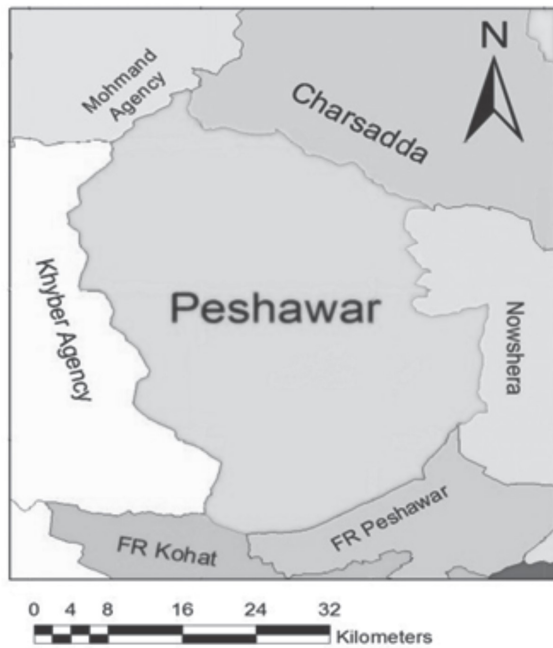
Figure 1: Location map of district Peshawar

Peshawar is the provincial capital of Khyber Pakhtunkhwa. Geographically it is located between 33.73° to 34.25° N and 71.37° to 71.70° E. Its total area is 1,257 km 2 and is approximately 358 m above the sea level. In 1998, the total population of Peshawar district was estimated to be 2.019 million. It is surrounded by Charsadda district and Mohmand Agency in the north, FR Kohat and FR Peshawar in the south, Khyber Agency in the west, and Nowshera district in the east. The central part of the district contains fine alluvial deposits. The cultivated territories consist of a rich, light and porous soil, composed of a mixture of clay, silt and sand which is suitable for cultivation of tobacco, wheat, and sugar-cane (Population Census Organisation, 1998). Location map of the study area is shown in Fig. 1.